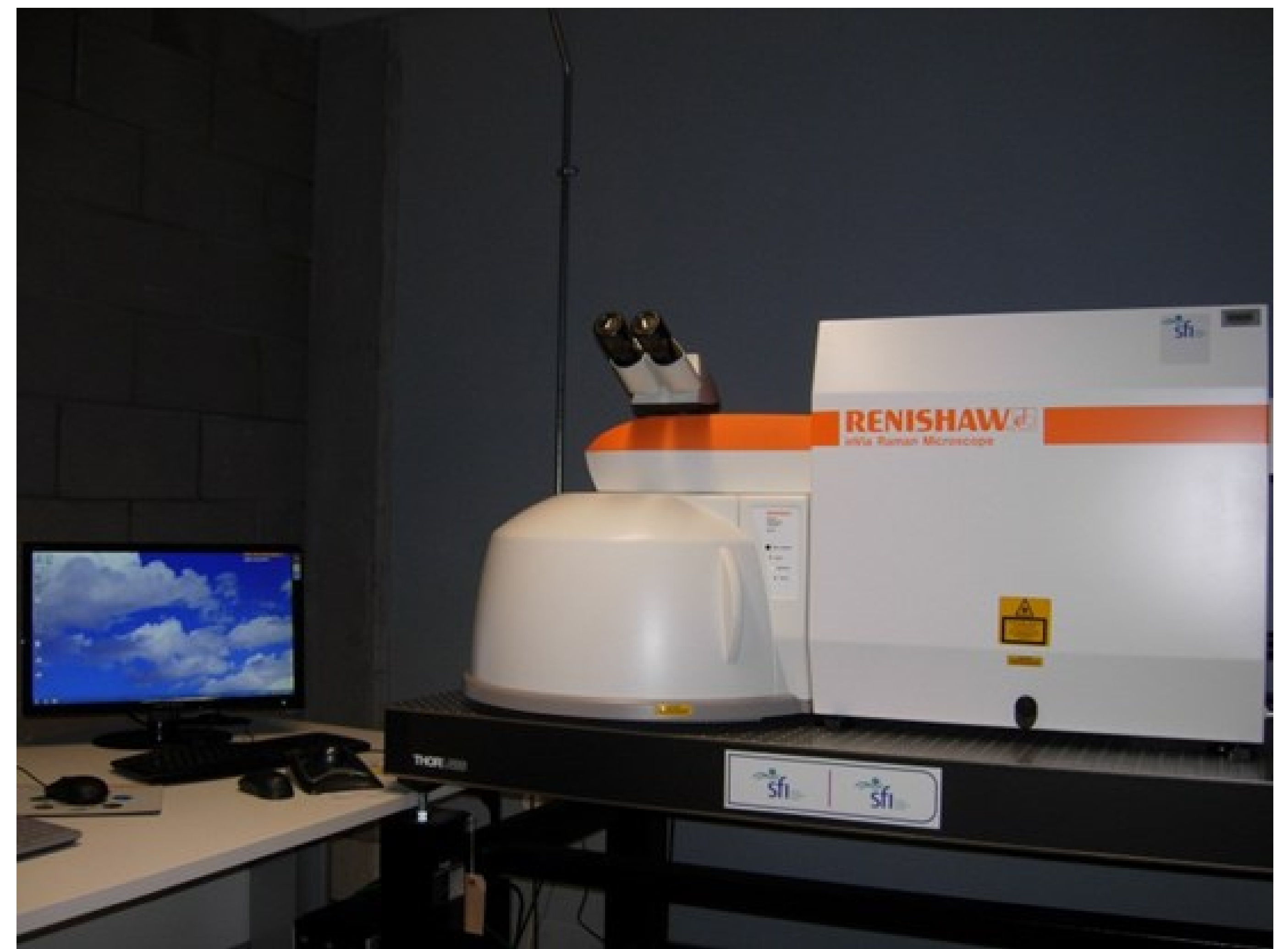
Fig.1: Renishaw InVia Raman Spectrophotometer (B) interfaced with JEOL Scanning Electron Microscope (A).