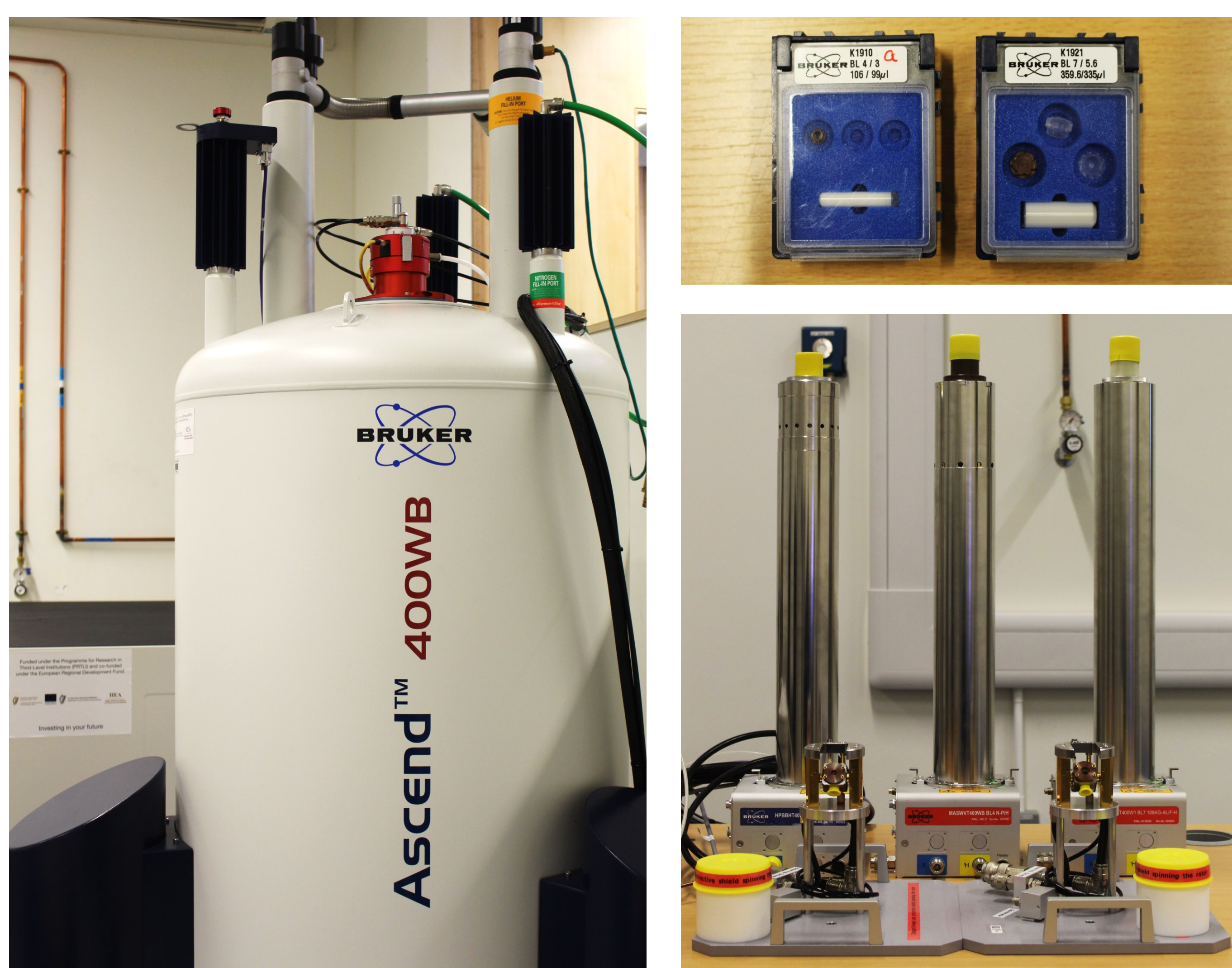
Figure 1. 9.4 T solid-state NMR magnet, probes, rotor spinning test stations, and sample rotors.